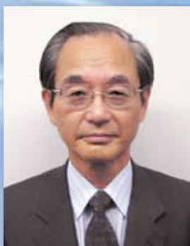
President, Japan Water Research Center Chairman, the 9 th International Symposium on Water Supply Technology Steering Committee

We sincerely look forward to everyone's participation in the 9 th International Symposium on Water Supply Technology.